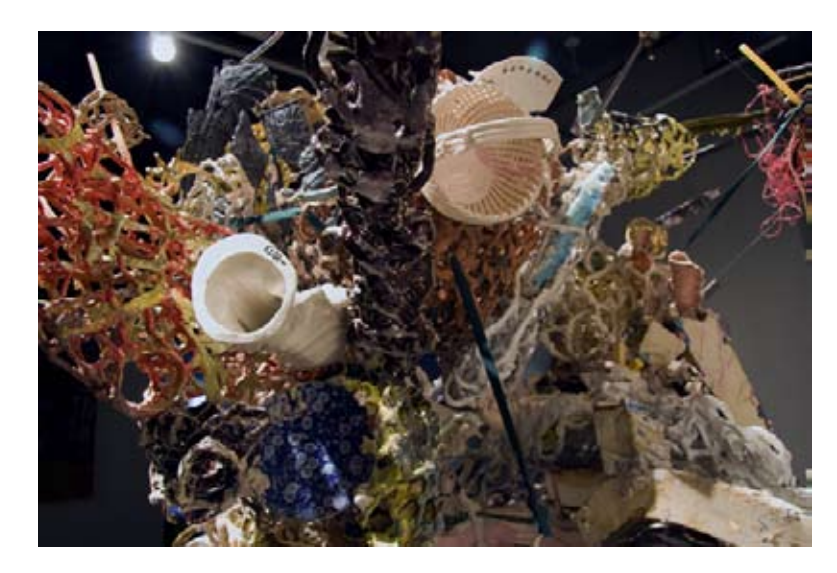
Linda Sormin Stow(detail), 2009 Ceramics and mixed media 6 x 8 x 10 feet

"The site looms above and veers past, willing me to compromise, to give ground. I roll and pinch the thing into place, I collect and lay offerings at its feet. This architecture melts and leans, hoarding objects in its folds. It lurches and dares you to approach, it tears cloth and flesh, it collapses with the brush of a hand. Nothing is thrown away."