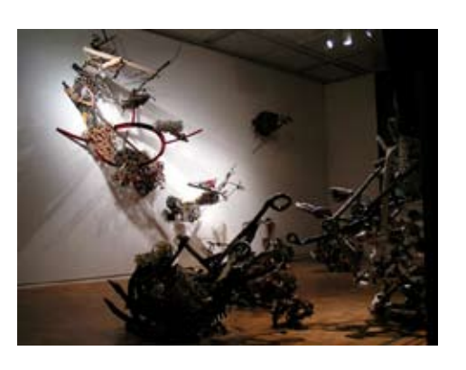
Linda Sormin Sounding Retreat, 2008 Ceramics and mixed media