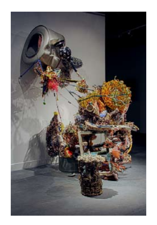
Linda Sormin Stow, 2009 Ceramics and mixed media 6 x 8 x 10 feet